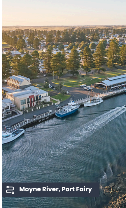
Moyne River, Port Fairy