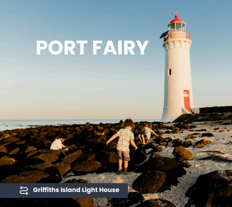
Griffiths Island Light House