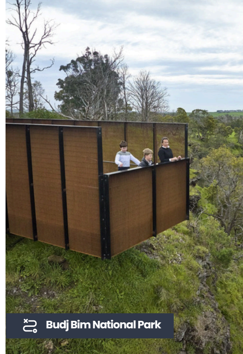
Budj Bim National Park