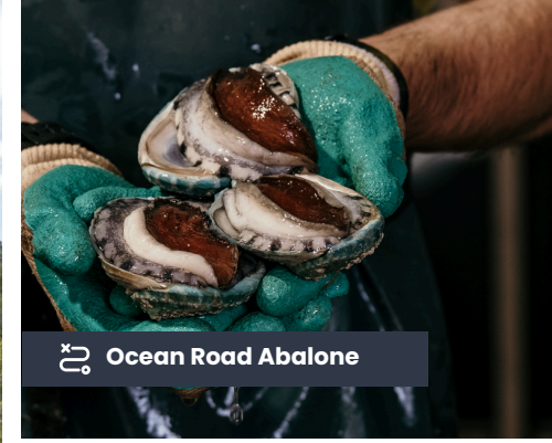
Ocean Road Abalone