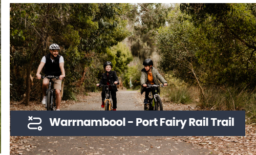
Warrnambool - Port Fairy Rail Trail

Located along the magnificent Great Ocean Road, Port Fairy is a quiet enclave on the edge of the dramatic Southern Ocean. Soak up the historic charm of this bluestone fishing village painted along the picturesque Moyne River. Discover More